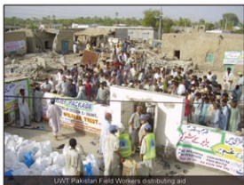
UWT Pakistan Field Workers distributing aid

In June 2007, cyclone Yemyin struck the Pakistani province of Balochistan with rain and winds of up to 80mph. Over a million people were left homeless and thousands were injured. UWT Pakistan immediately launched an emergency operation and aid was provided to over 50,000 people in various villages and rural areas of the province.