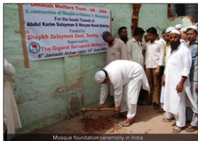
Mosque foundation ceremony in India

UWT reconstructed numerous Mosques in the earthquake region of Pakistan. Over the past year, UWT has constructed Mosques in Afghanistan, Bangladesh, India and Pakistan.