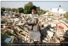
A Palestinian in anguish after his home is reduced to rubble

UWT launched an emergency appeal in partnership with Interpal, Muslim Aid and Islamic Help to signal unity and co-operation for the Palestinian cause. Despite the blockade, UWT was able to provide sixty tonnes of flour, fuel, medicine kits and food parcels to thousands of desperate Palestinians.