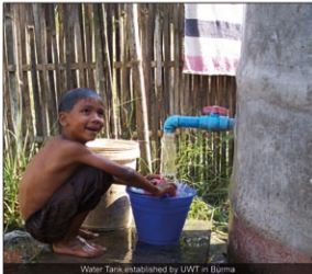
Water Tank established by UWT in Burma