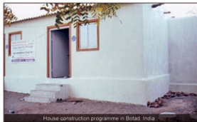
House construction programme in Botad, India

There are thousands of people around the world without a roof above their heads. Victims of conflicts and disasters become desperate when their homes are destroyed. Since its inception, UWT has various house construction and shelter programme across the world. Over the past year, UWT funded the construction or renovation of over 300 houses in Bangladesh, Burma, India, Pakistan & Palestine.