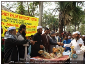
UWT representative distributing aid to Bangladesh cyclone victims

UWT launched a joint emergency appeal with the Muslim Welfare Institute (MWI). The first phase of emergency aid was implemented swiftly. The greatest challenge for the charities was to consider the long term consequences of the cyclone and assess how to regenerate the economy. Subsequently, UWT & MWI representatives visited the region and after a detailed assessment and consultation with Bangladeshi ministers, a long term regeneration plan was finalised. Over the past few months, various income generating projects, water projects, house and Mosque construction programmes have been initiated and the whole project is due to complete by September 2008.