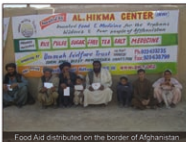
Food Aid distributed on the border of Afghanistan