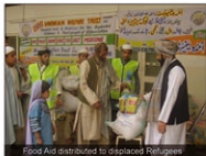
Food Aid distributed to displaced Refugees

The situation in Afghanistan is deteriorating rapidly and since its inception, UWT has assisted millions of Afghani people. In March 2008, UWT representatives distributed 5000 medical kits in Kandahar through various medical clinics. Food packs were also provided to 5,000 displaced families on the border of Afghanistan.