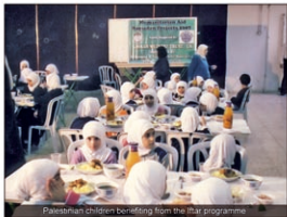
Palestinian children benefiting from the Iftar programme

At the time of Eid al-Fitr, UWT also distributed Eid gifts in Bangladesh, India, Palestine and Pakistan.