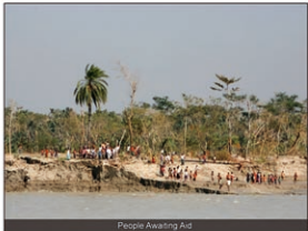
People Awaiting Aid

With winds exceeding 150mph, it annihilated everything in its path, claiming over 10,000 lives and destroying 1.2 million homes.