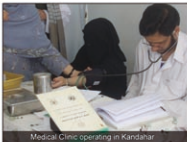
Medical Clinic operating in Kandahar