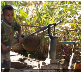
Water Well dug by UWT in Burma

In June 2008, UWT launched a unique water irrigation project in Gaza in association with the National Association of Moderation and Development (NAMD) and Interpal. Many water wells in Gaza have been destroyed as a result of Israeli aggression and repeated incursions whilst some have stopped operating due to fuel sanctions. This has resulted in severe water shortages affecting the people and the farming industry. The aim of this project is to contribute to the rehabilitation of 15 water wells to operate on electricity instead of diesel.