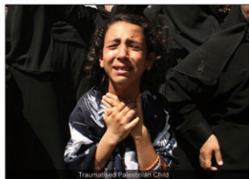
Traumatized Palestinian Child

Over 50,000 have suffered from nightmares and bad dreams, and no less than 30,000 children are suffering from chronic malnutrition due to polluted water and poor diet conditions.