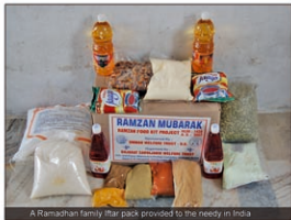
A Ramadan family Iftar pack provided to the needy in India

In the month of Ramadhan, many Muslims do not have sufficient food for Suhoor and Iftar. UWT operates an International Iftar scheme in various countries and mass Iftar events are organised. Last Ramadhan, in association with Human Appeal International, we were able to provide Iftar in the compound of Masjid al-Aqsa.