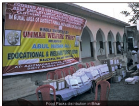
Food Packs distribution in Bihar

Bihar is one of the poorest states of India. It is often called India's "failed state." According to official figures, it falls at the bottom of almost all social and economic development indicators. Bihar's record has a major effect on the national record in poverty alleviation and other indicators, as, with a population of 83 million, Bihar is the third largest state in the country. One-seventh of India's below-the-poverty-line (BPL) population live in Bihar.