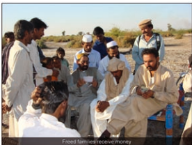
Freed families receive money