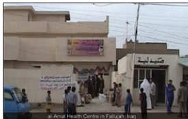
al-Amal Health Centre in Fallujah, Iraq

Since the first Gulf War, Iraq has become the symbol of suffering. Millions of people have died due to lack of medical supplies and poorly resourced hospitals. Despite the ongoing violence, UWT continues to sponsor the al-Amal Health Centre in the al-Askari district of Fallujah. The centre has provided free medical checks to over 75,000 patients over the years.