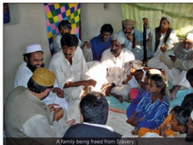
A family being freed from Slavery

According to the Human Rights Commission of Pakistan, there are an estimated 50,000 bonded labourers in the Sindh province. For most people, slavery conjures up images of shackled Africans held in dark cargo holds of ships crossing the Atlantic. However, bonded labour is a contemporary form of slavery, where people are forced into slavery due to debts inherited from past generations. UWT has embarked on this extraordinary initiative to liberate these bonded labourers and to rehabilitate them back into society. Over the past year, UWT has freed over one thousand slaves and provided them with clothes, household utilities, donkey carts and sewing machines for income generation.