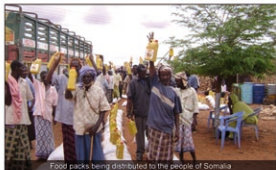
Food packs being distributed to the people of Somalia

Somalia has been facing a humanitarian crisis for many years due to continuous drought and violence. Two million Somalis are suffering from famine, diseases and water supply shortages. UWT initiated operations in Somalia by providing food aid to 3,700 families across the regions of Hiran and Galgaduud. UWT has also initiated various development projects to regenerate the livelihoods of the Somali people.