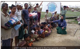
UWT trustee distributing aid to Burma cyclone victims