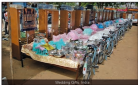
Wedding Gifts, India

In April 2008, UWT initiated this unique group weddings project in India and Bangladesh. Many poor people are unable to afford the dowry and the basic livelihood tools to support a family. In India, UWT funded fifty seven marriages at a cost of £175 each. Similarly, in various towns and villages of Bangladesh, one hundred marriages were sponsored at a cost of £225 each. UWT intends to expand this project as the lack of financial resources has led rich landlords to abuse the poor girls and enslave them.