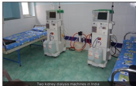
Two kidney dialysis machines in India

In India, UWT purchased four dialysis machines at a cost of £8,000 each; this will provide dialysis service for 3,600 patients every year. Similarly, UWT funded cataract operations for a hundred patients in the city of Ahmedabad. In Bangladesh, UWT supported the treatment of two hundred mothers and their children in the regions of Gazipur, Kishoreganj & Rangpur.